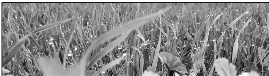
Crystal Drops.