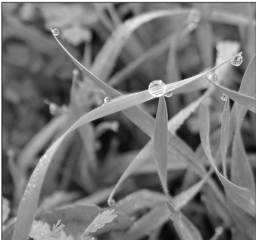
Rain Drop Blessing.