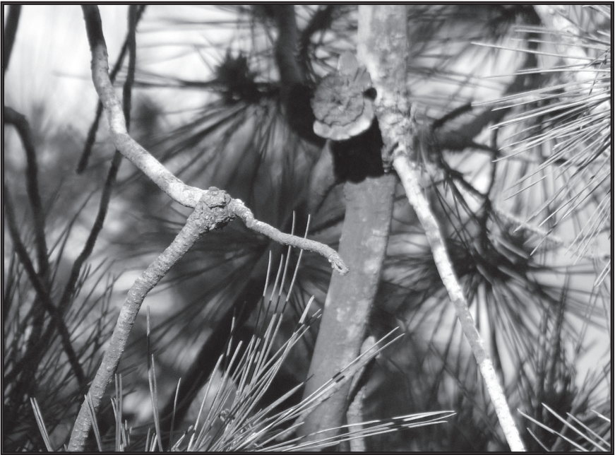
Halcyon Pine Shadows 1.

I would not have you think, my children, that life is all a curse, that there is nothing but blackness and darkness and destitution for the children of men. But I do desire to awaken those who are sleeping. I do desire to bring them to the point where they can recognize the fact that their destiny is in their own hands — not in the hands of a God, not in the hands of a Master. When you can make yourself that house of prayer which is meant in the passage above referred to, you can turn everything around and about you