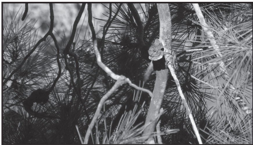
Halcyon Pine Shadows 2.

When an individual permits a personal bias in some one direction to cloud his power of righteous judgment he jeopardizes his power of correct vision in other directions and correct vision is dependent upon adherence to the divine fundamental laws of growth. It is not easy for man to understand that two diametrically opposed methods of action may both be right.