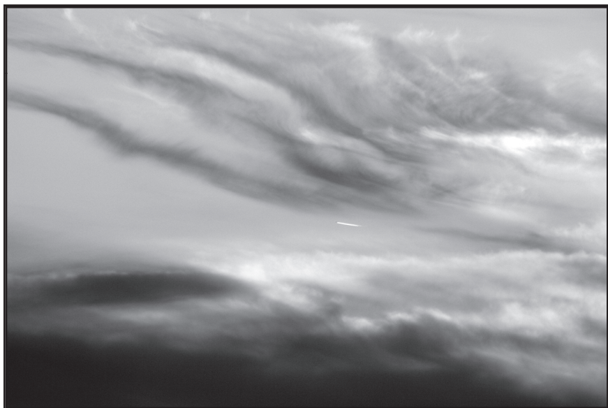
Calling Abl.