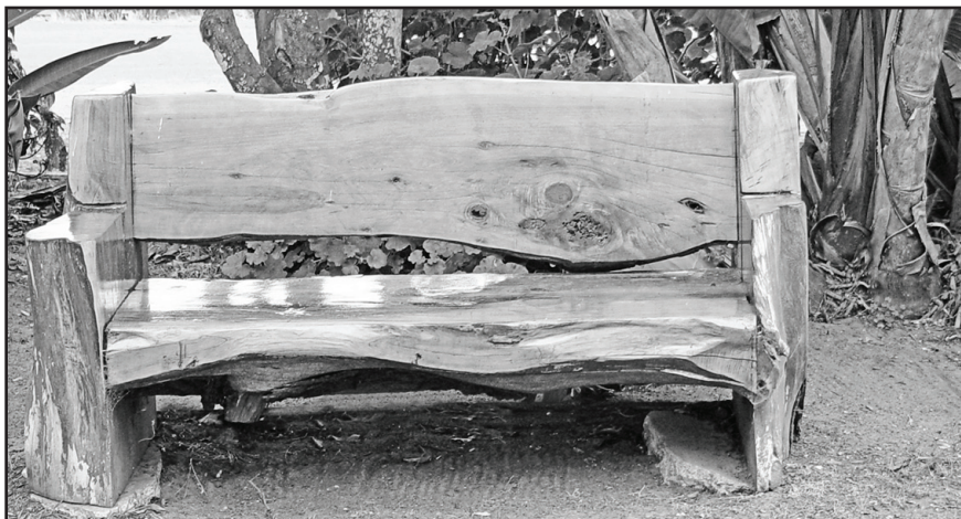
Temple Bench.