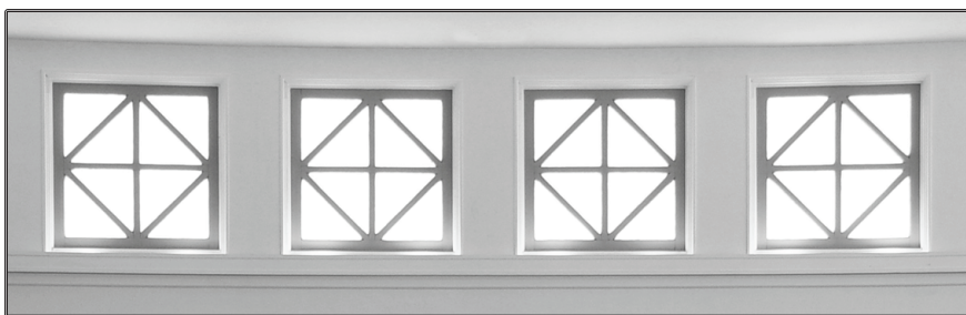
Windows Four.