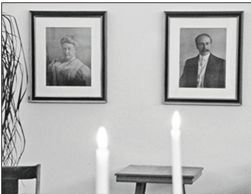
Guardians.

We are bound to the principles to which we have pledged ourselves, and we are trusted to have the self-responsibility to carry out those principles in our daily living. As Master Hilarion has said, "it is not dramatic deeds that count in time of crisis," but rather "duty well-cared for, distress eased in seclusion, love administered in faith, and compassionate silence that conquers all."