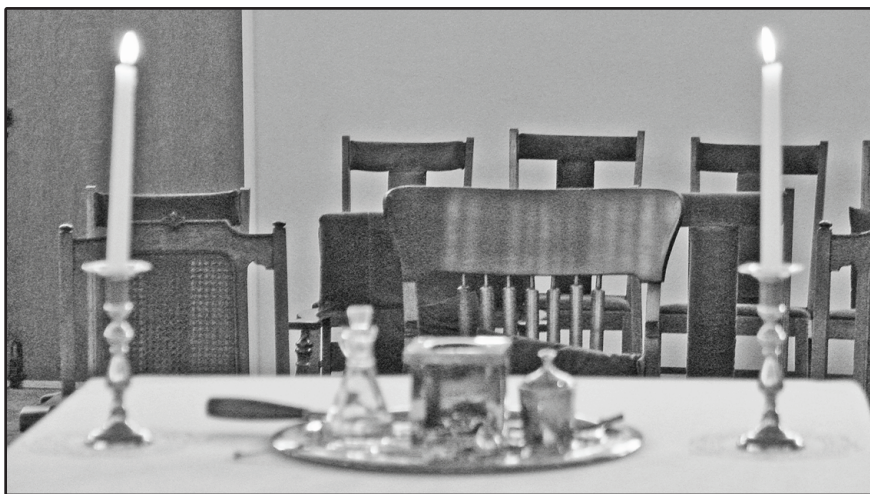
Central Altar.