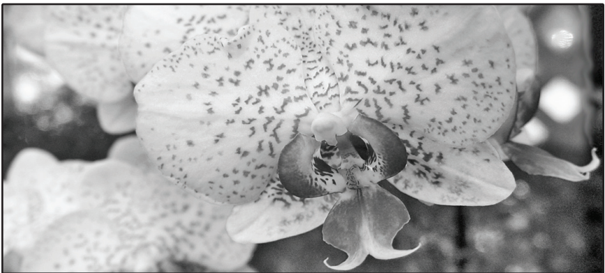
Orchid Blossom.