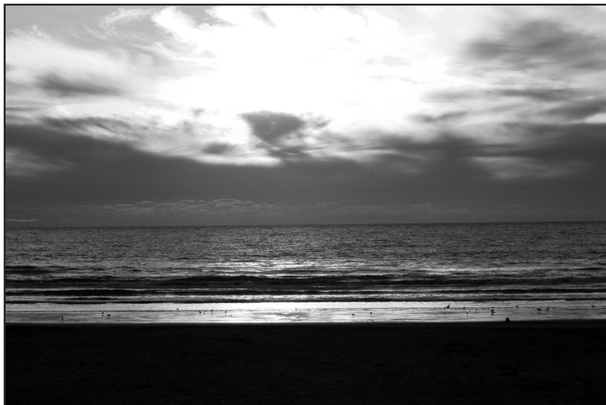
New Year's Eve Sunset, Pismo Beach.

Great Temple, we sing, "All we are or hope to be, Here and now we offer Thee." This offer is accepted and cannot be withdrawn.