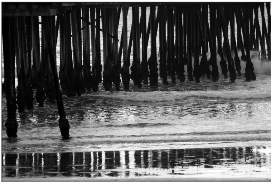
Reflections, Pismo Pier.

I cannot tell or command you on what to do next. “Walk the talk” is my mandate. I can only do for myself, I can only share with you my feelings when I succeed or stumble, share with you the things that have and are giving my life meaning, and listen carefully to you as you share your feelings of the meaningful qualities of your life as well as your perceived faults, failures or times of anguish. As we build these bridges of communication between us, we will all arrive gradually at places where we can effect significant changes in ourselves. Of course we will fail at times, quarrel, take our toys and go home, creep out to try again, change techniques, and agree to disagree if necessary. The workplace for all of this is with each