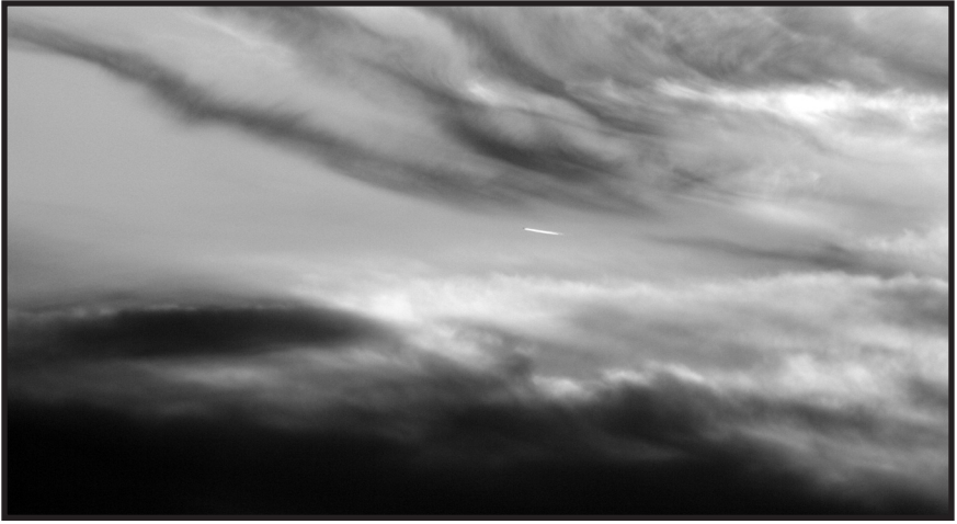
Painted Sky, New Year's Eve.