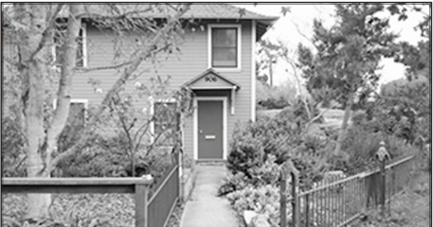
Office Door