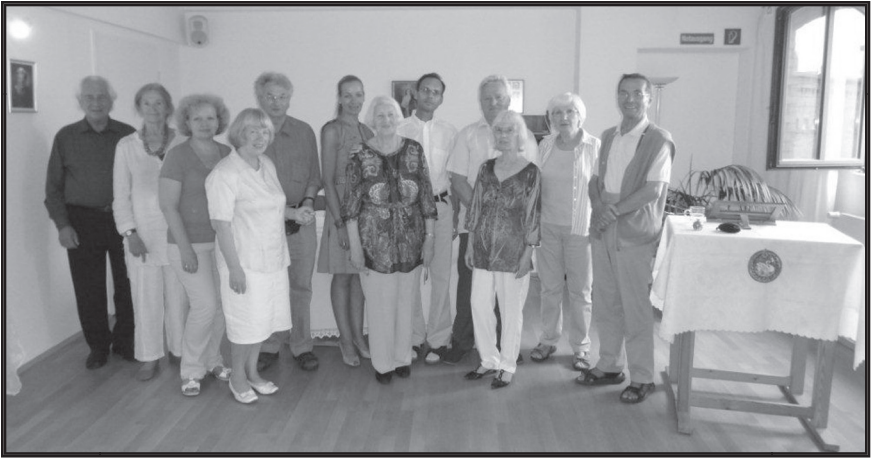
Members of the German Section at their Temple Convention in Berlin.