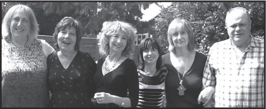
Members of the Temple's London Section take a moment for a photo during their Convention activities.