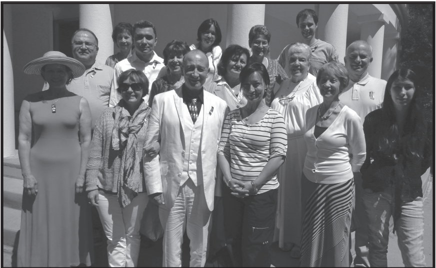
Some Templars travel a long way to be part of Convention. Here they gather with the Guardian in Chief on the Temple steps following the formal opening.

—Your Brothers and Sisters in St. Petersburg