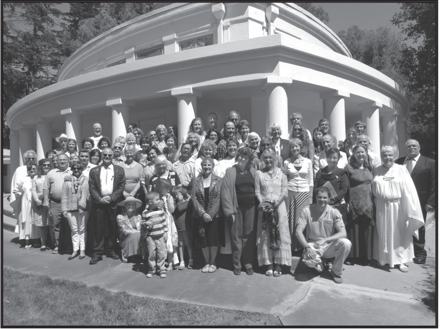
Templars of all ages gather on the steps of the Blue Star Memorial Temple after the formal opening of the 113th Annual Convention in Halcyon.