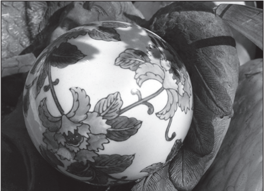
Sphere.

Dear Ella Young, she must have noticed that, no matter how much we wished and tried to stay attentive, one of us, sometimes, would drop out of earshot. Why didn't we use a tape recorder?