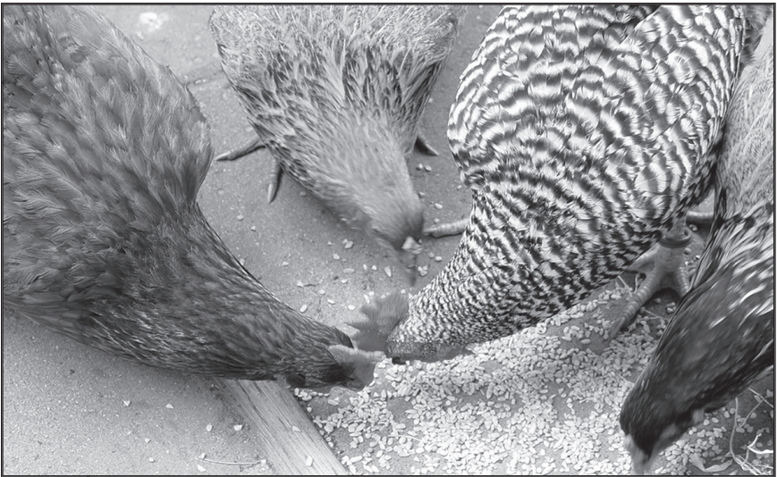
Chicken Spiral.

In the next paragraph, Harold wanted me to seriously consider the applications and implications. We discussed them at length. The lesson reads: "For instance, rare articles are needing preservation in various places. Some are being destroyed by wear and tear, exposure