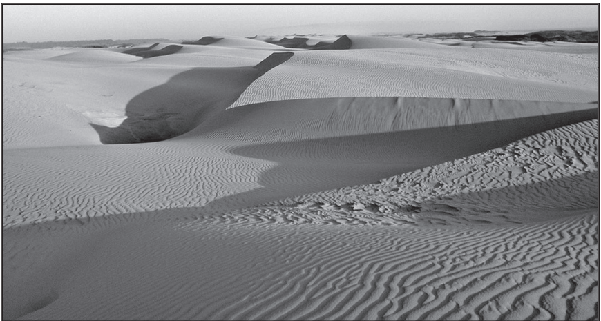
Dune Patterns.

As winter ends, many of us have had the flu of all types. However, after time, rest, and lots of fluids worked their magic, we are all feeling much better—as the coughs fade, the twinkle comes back to the eyes! May this Spring bring health and joy to one and all.