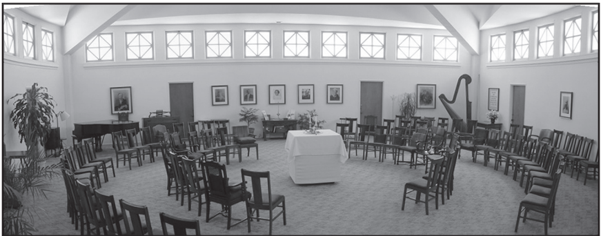
Interior of the Blue Star Memorial Temple.